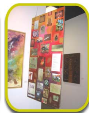
eco'arts mural at the International Visions Gallery - Washington, DC