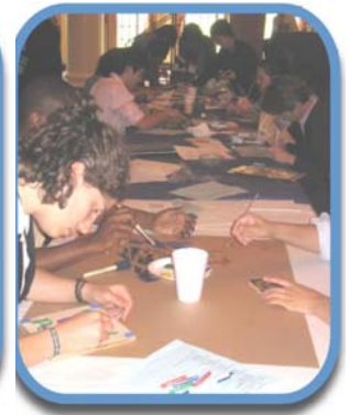
Photos: Participants talking about their tiles and expressing their thoughts on those vital health issues that they intend to address with their tiles