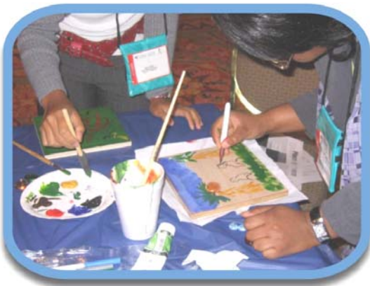
Photos: GHC workshop participants working on their peace tiles

The hands-on arts activity created an opportunity for participants to learn about the tile making process and its outcomes: a communication starter ( to bring groups together and engage them in dialogue ), and a self-expression and an advocacy tool.