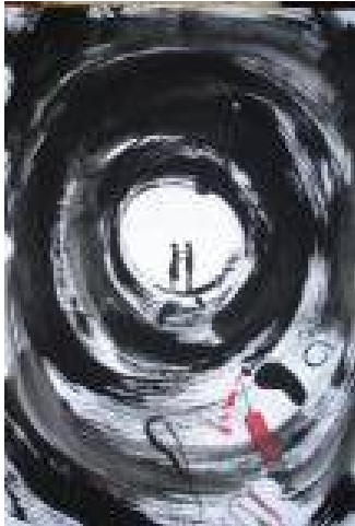
'Caution' by Chidi Ewa