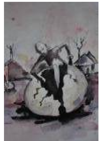
're-created' by Ike Tochukwu